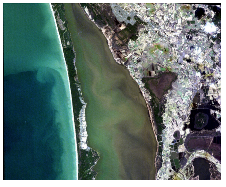
PRISMA satellite true colour image of the Curonian Lagoon.

CERTO is progressing water quality monitoring by offering near-real-time and on-request data through its portal. It meets the immediate needs of researchers and stakeholders while enriching the pool of assessment tools with new indicators for more accurate and precise evaluations. CERTO contributes to scientific inquiry through shared insights in publications, continually informing and enhancing practices in water quality monitoring.