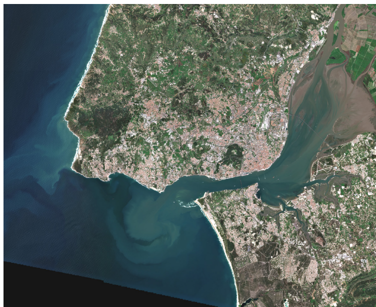
Sentinel 2B satellite image of the Tagus Estuary.

CERTO is progressing water quality monitoring by providing a prototype that can offer near-real-time data. It meets the immediate needs of researchers and stakeholders while enriching the pool of assessment tools with new indicators for more accurate and precise evaluations. CERTO contributes to scientific inquiry through shared insights in publications, continually informing and enhancing practices in water quality monitoring.